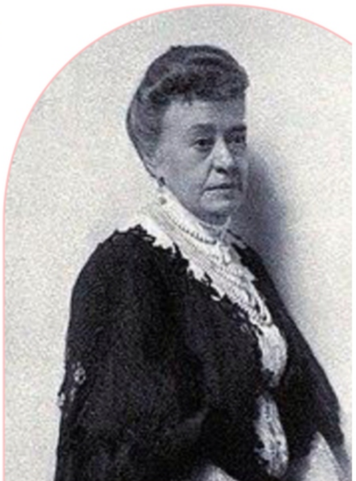
Jane Elizabeth Lathrop Stanford 1828-1905