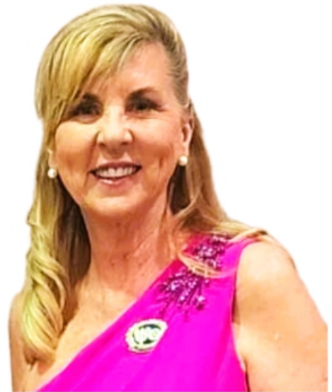
CFWC 1 st V.P.