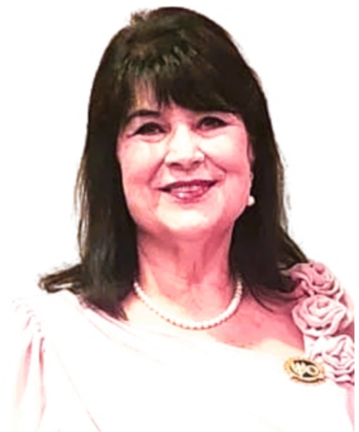
CFWC 2 nd V.P.