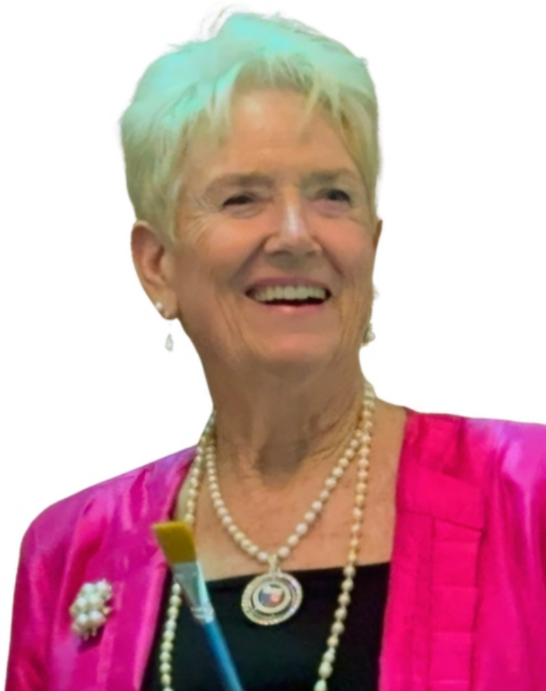
CFWC President - 2026 - 2028